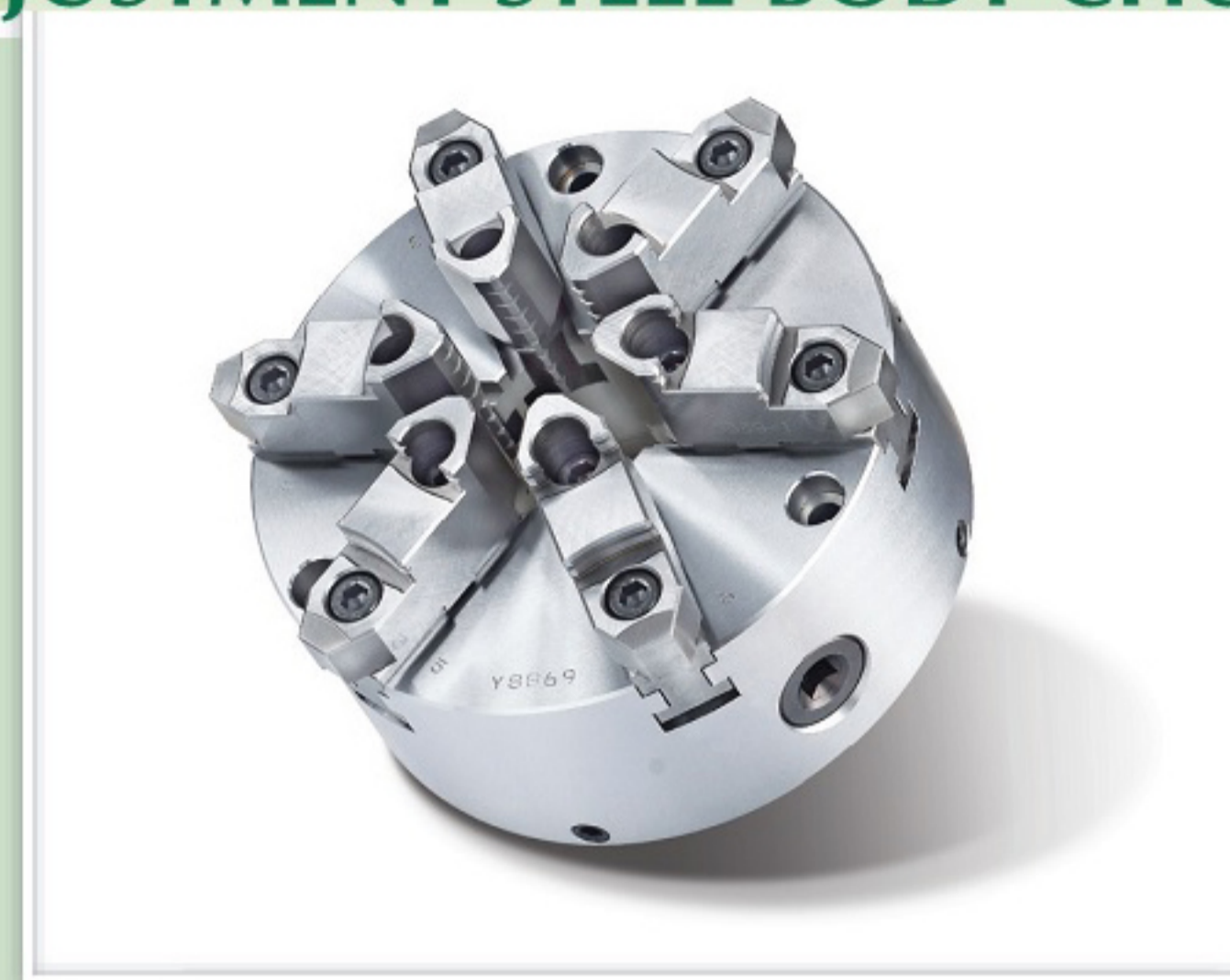
規格表 » Specifications