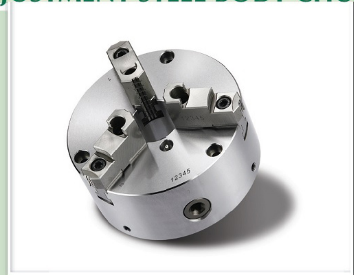
規格表 » Specifications